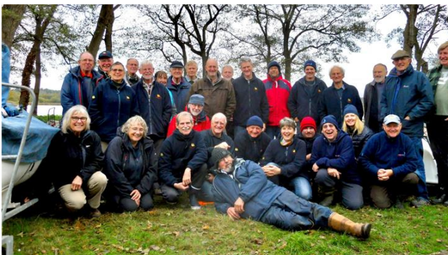
Helpers at Laying-up Day

Overall, 2021 has been a good year for Frensham Pond Sailability with both fun and success on the water. Let us now hope for a normal start to the 2022 season and further success for all our sailors. None of this could have been achieved without our dedicated and wonderful helpers, so a big thank you to all of you.